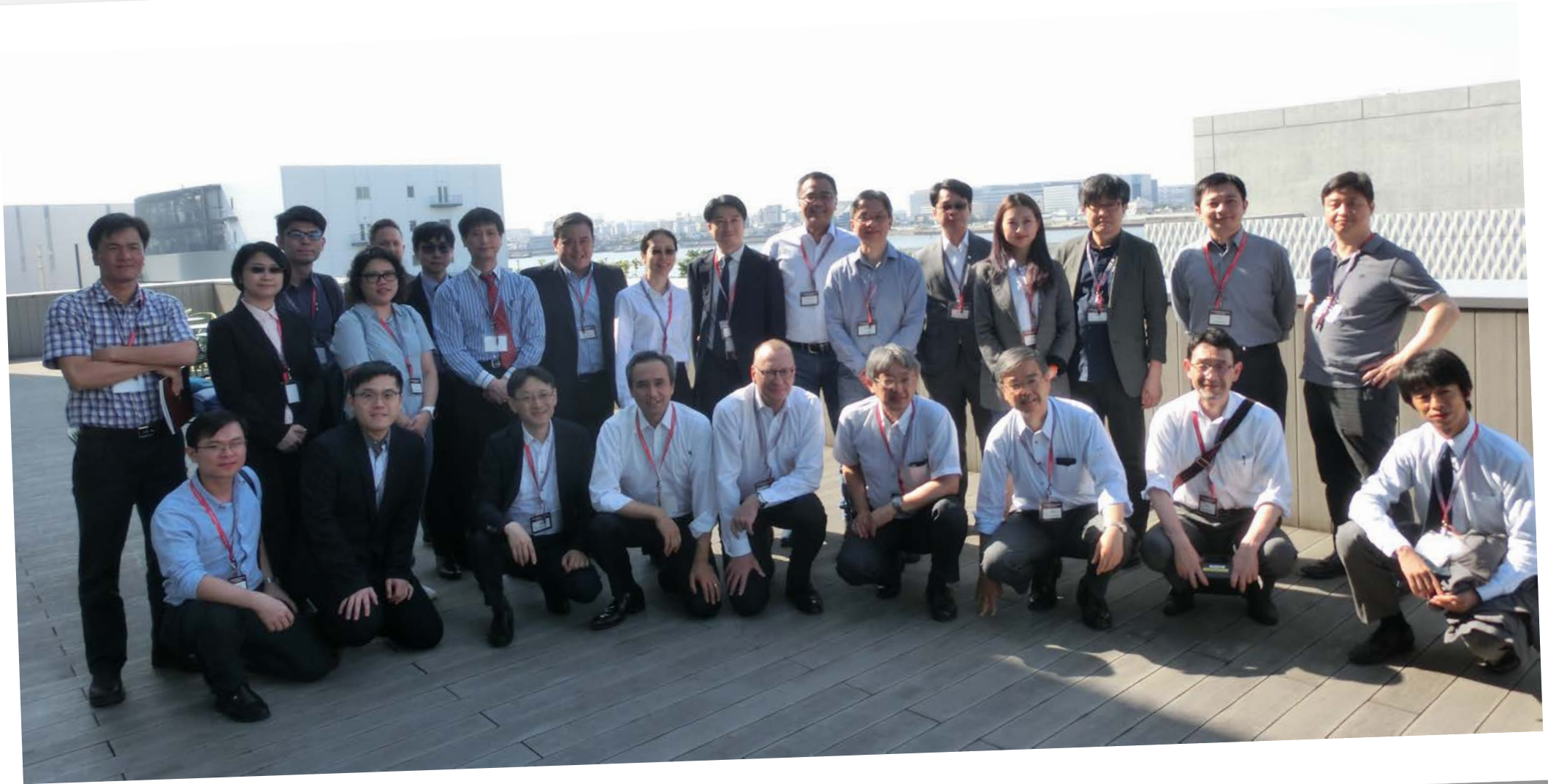
18 attendees from 6 countries including Taiwan, Singapore, Thailand, Vietnam, Korea, and Hong Kong.