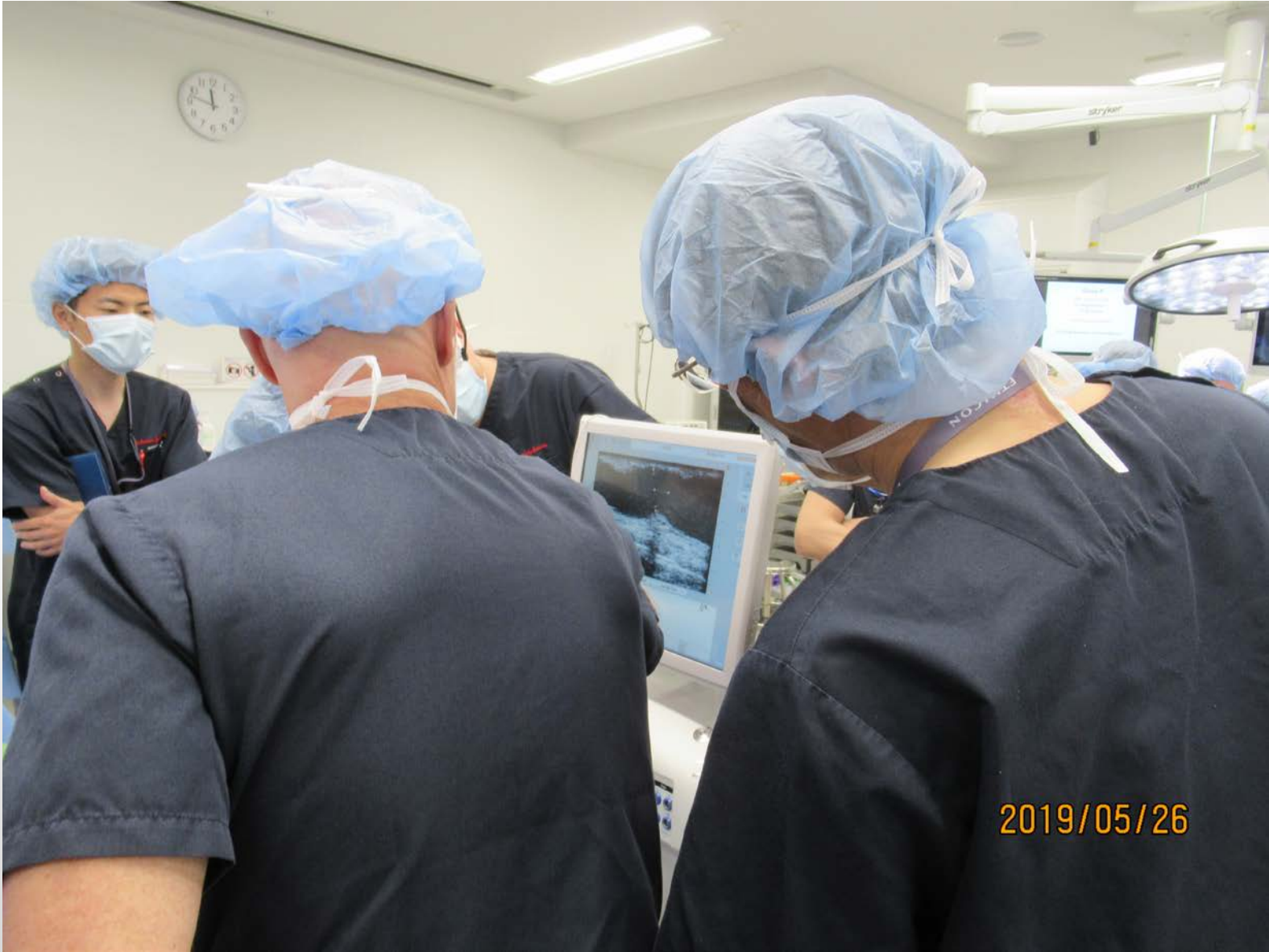
Measuring graft flow & flow imaging at anastomosis