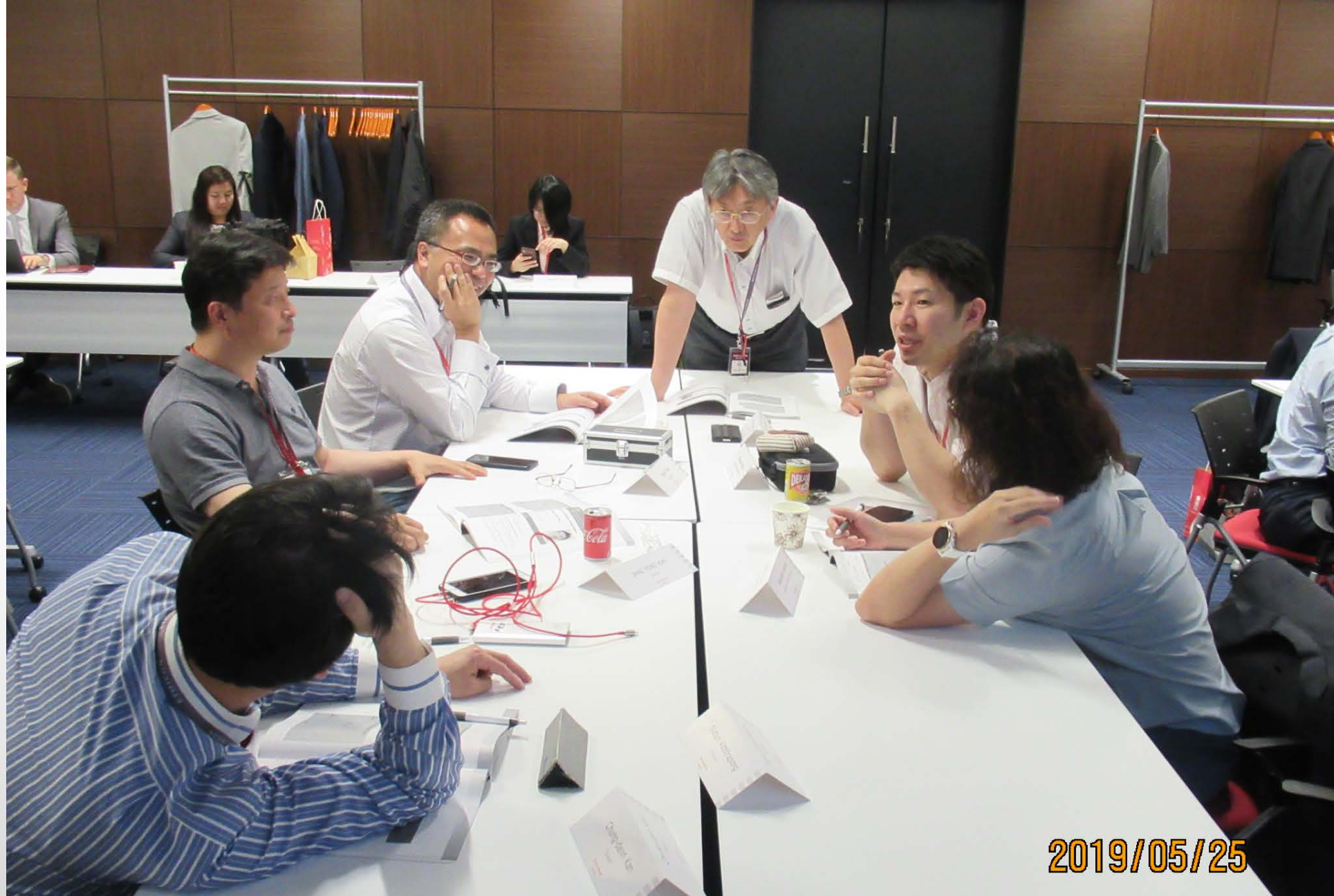
Round Table Discussion discussing treatment strategies using clinical cases